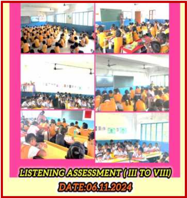
LISTENING ASSESSMENT (III TO VIII)