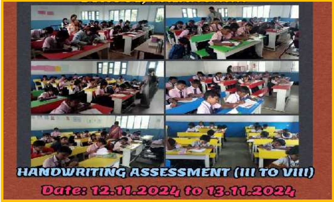
HANDWRITING ASSESSMENT (III TO VIII)