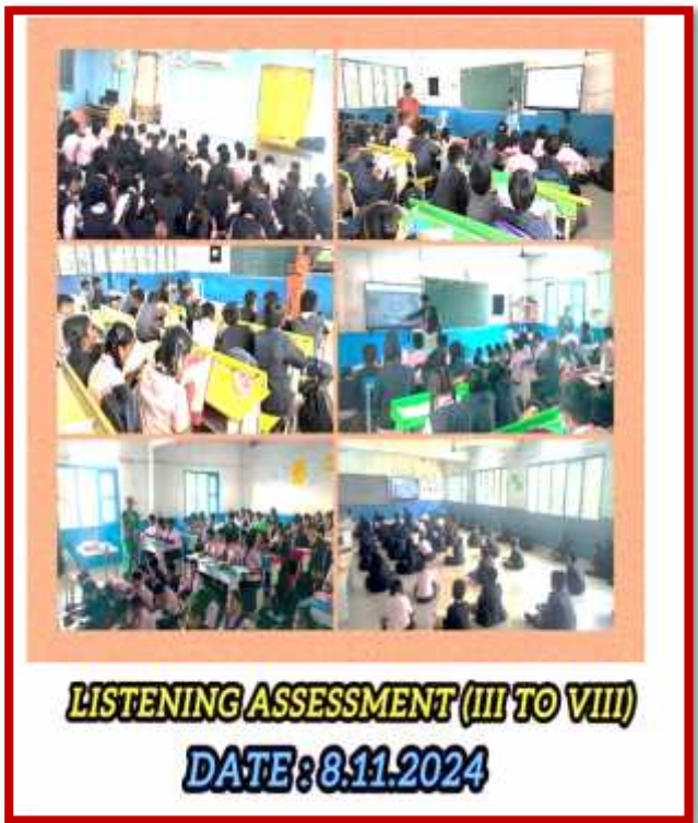
LISTENING ASSESSMENT (III TO VIII)